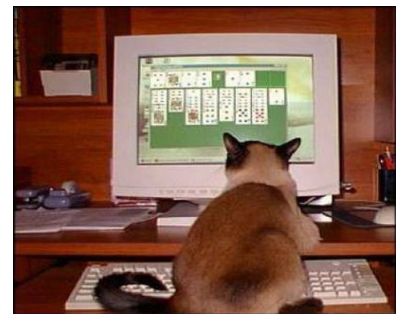
But can a cat use a computer?