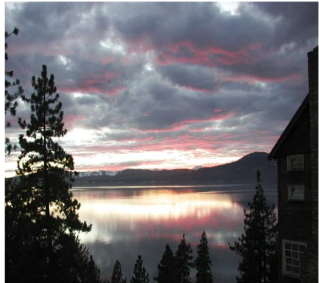
Lake Tahoe Sunset