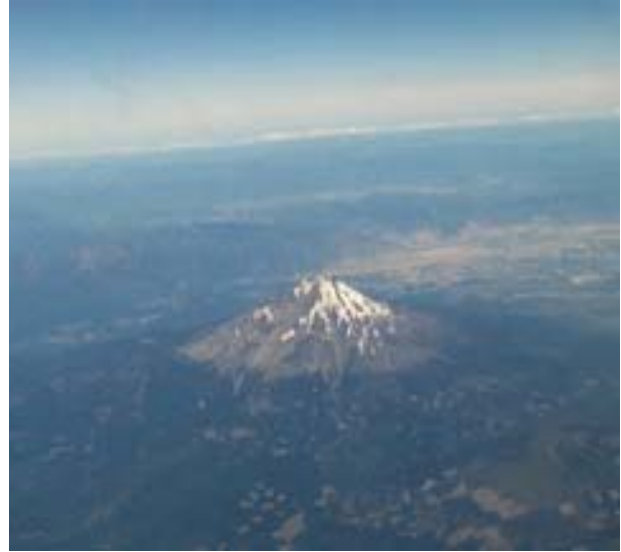
Mt. Shasta from the window of an Airplane