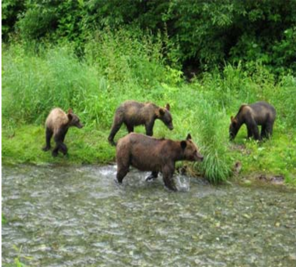
Hyer Alaska, Monica and her cubs

Submit your photos, along with a brief description, for publication in the next Bits & Bytes publicity3@gcclc.org