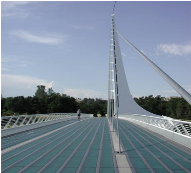
Sundial Bridge, Redding CA.