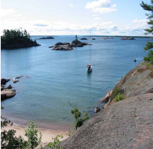
West Benjamin Island, Anchorage

Submit your photos, along with a brief description, for publication in the next Bits & Bytes publicity3@gcclc.org