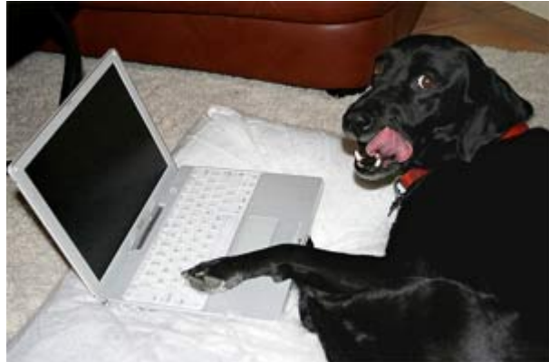
Who said you can't teach old dog new tricks?