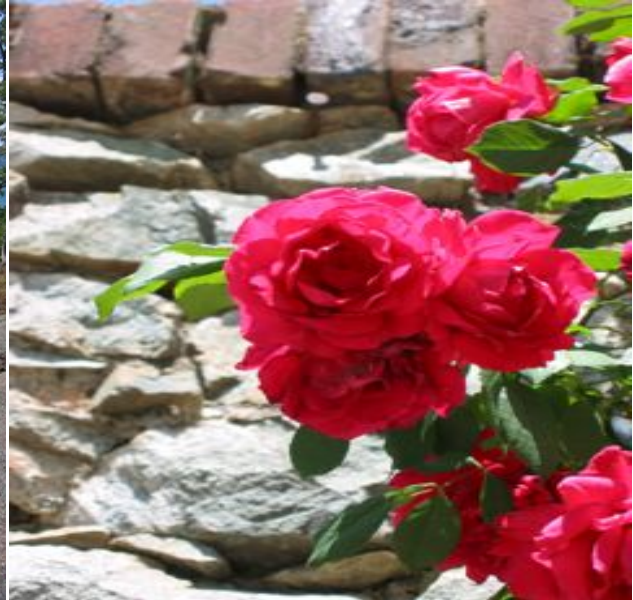
Roses at Empire Mine State Park