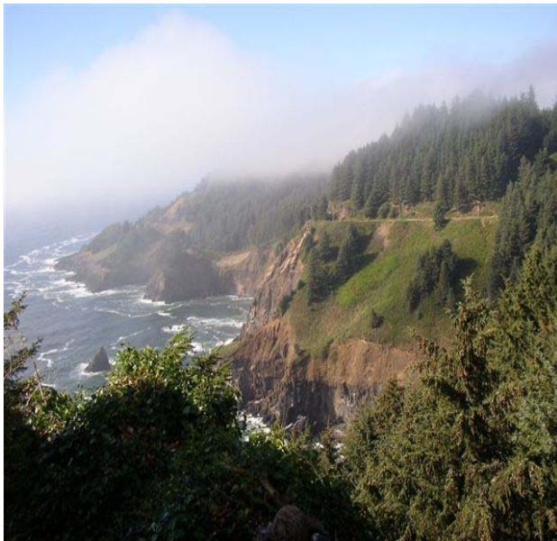
Oregon Coastline